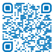
Sun & Snow

Other team apparel ( sweatshirts, t-shirts, and sweatpants ) is not required but may be ordered online at squadlocker.com . Enter the team store name of Liberty Lightning Swim Team , and order both adult and youth sizes in a variety of colors and brands.